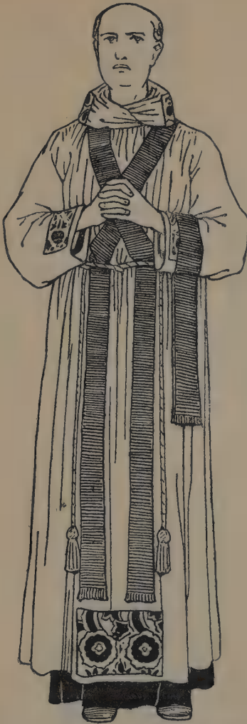
PRIEST IN CASSOCK, AMICE, ALB, GIRDLE, MANIPLE, AND STOLE.